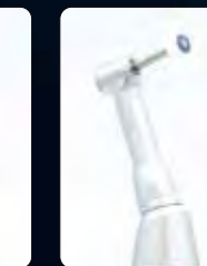
All Discs (RA)