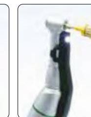
Rotating head 16:1. For all RA tools, with LED Light.