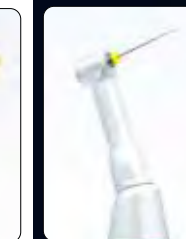
All RA Endo file