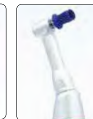
Rotating Push button head 16:1 suitable for all RA contra-angle tools