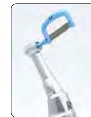
Reciprocating head 1:1 suitable for all reciprocating automatic strips