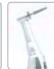
Reciprocating head 1:1 suitable for all reciprocating Proxo file